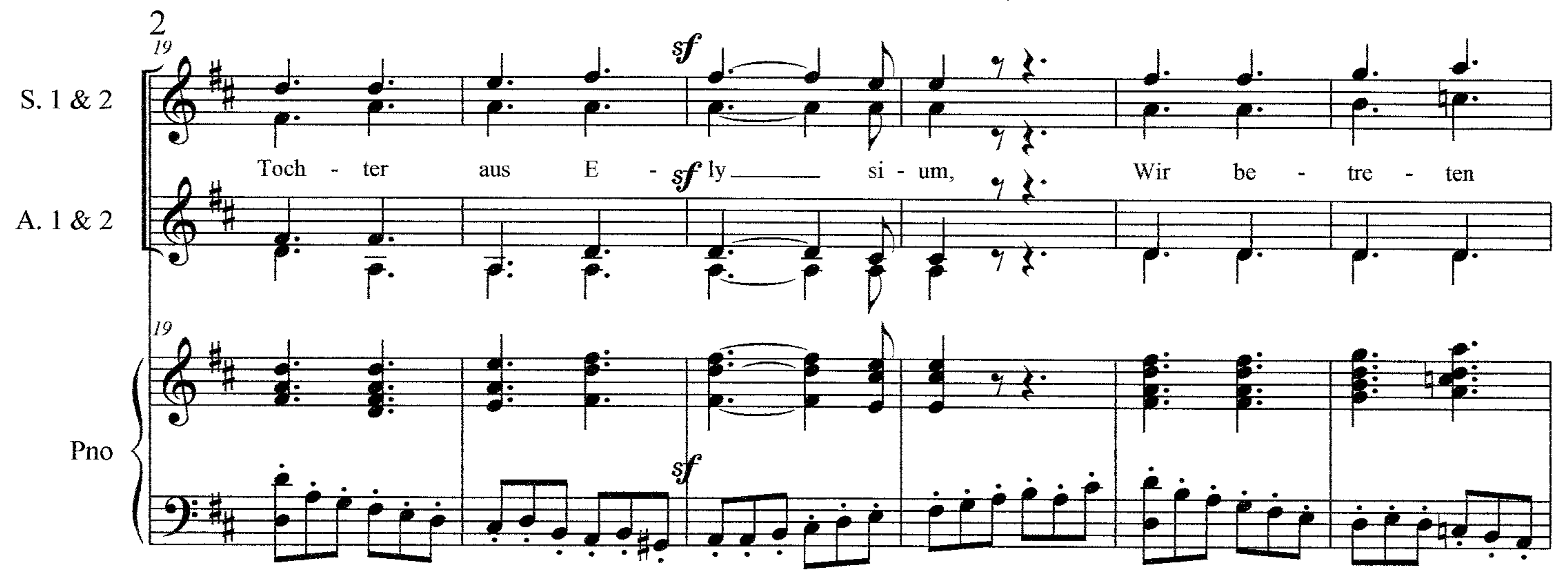
Ode to Joy (An die Freude)